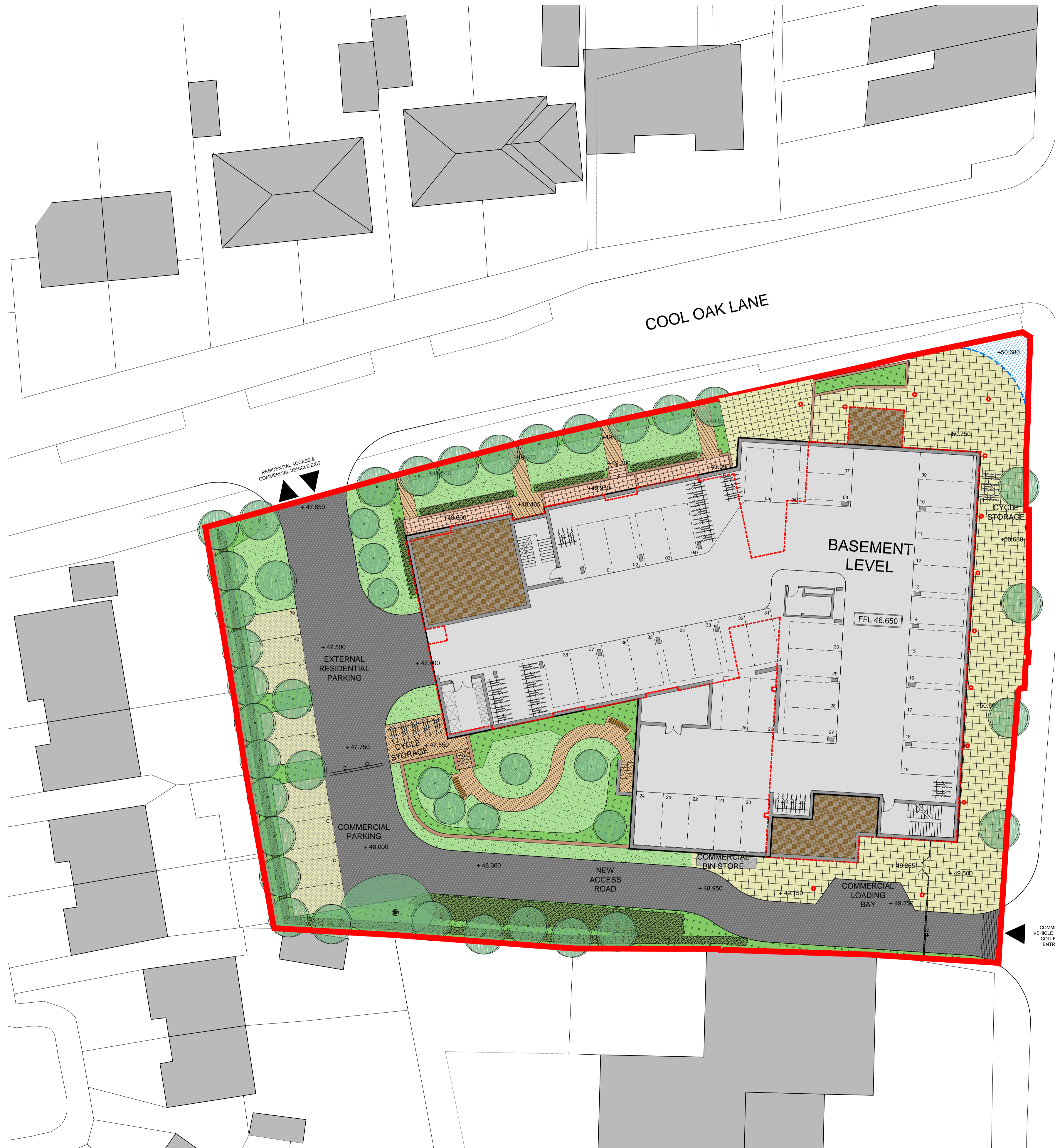
PROPOSED SITE PLAN - BASEMENT LEVEL

ATTENTION IS DRAWN TO THE FOLLOWING REMAINING SIGNIFICANT HAZARDS